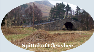
Spittal of Glenshee

Guided tour of the ancient MacThomas lands, lunch at the Glenshee Ski Slopes, and on to Braemar and Balmoral in Royal Deeside