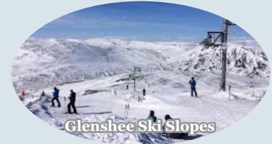
Glenshee Ski Slopes