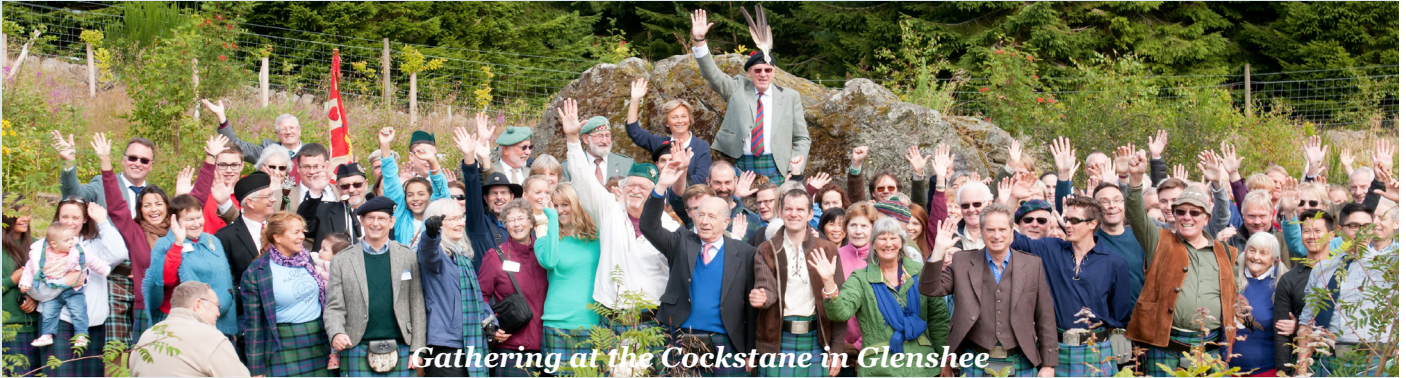
Gathering at the Cockstane in Glenshee

Experience the beauty, tranquillity and reverence of our ancient gathering place in the presence of Finegand himself.